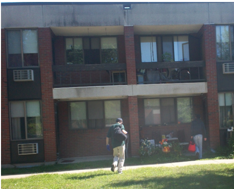
League School students both package and deliver meals as part of HESSCO’s Meals on Wheels program.