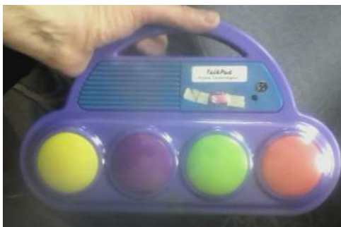
This is a "Go Talk" communication device with programmed sentences for the art room. It looks like an art palette but is used by non-verbal students to make requests such as "May I wash my hands please?"